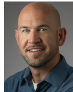
Exhibit Sales Consultant 405-832-9090 (Alpha #, A-L) anner@MPeshows.com